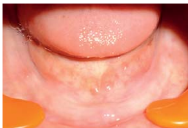
Intra oral presentation lower