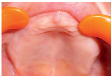
Intra oral presentation upper