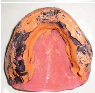
Neutral zone recording(fig 2)