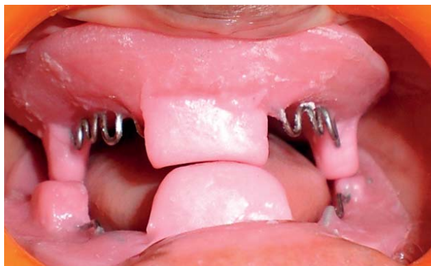
Record bases with anterior and posterior vertical stops (fig 1)