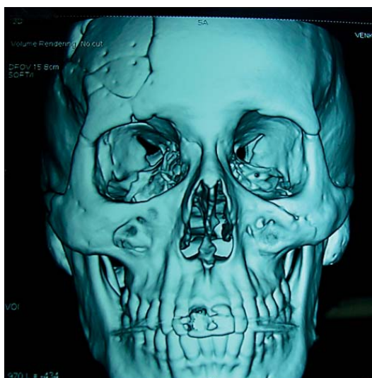
Fig 2 Three dimensional CT scan showing increased right orbital volume