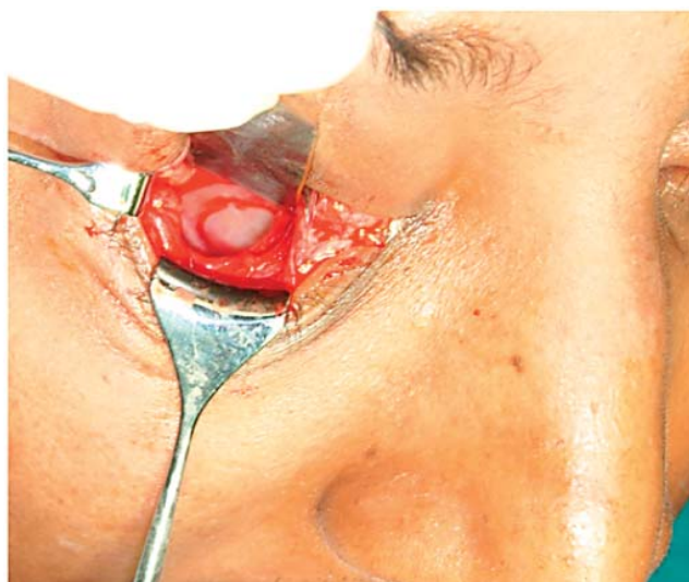
Fig 4 Silastic implant