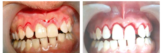
Figure A: During incision