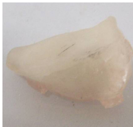
Figure 6: Hollow Bulb