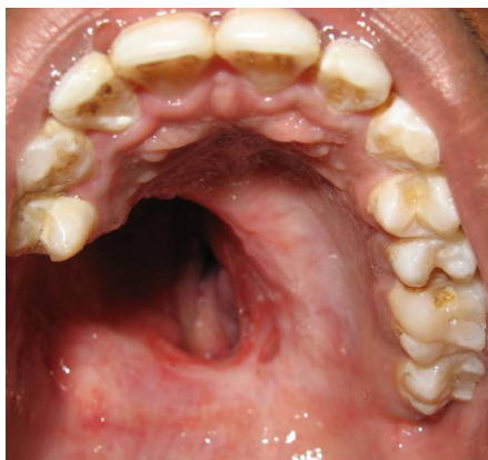
Figure 1: Intraoral View of the Defect