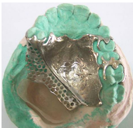
Figure 5: Fabrication of a Shim