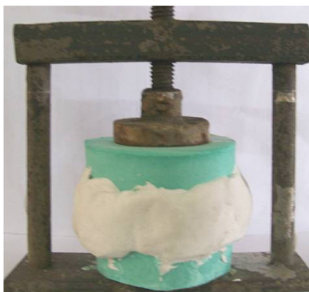
Figure 4: Flasking Technique