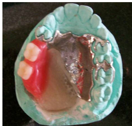
Figure 3: Trial Denture