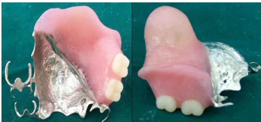
Figure 7: Hollow Bulb Obturator