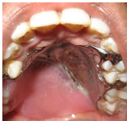
Figure 8: Intraoral view of the Obturator