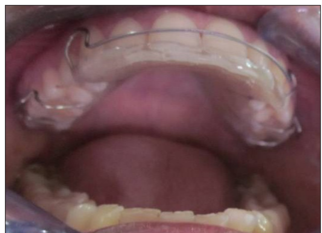
Figure 6 - A normal orthopantomogram with no evidence of pathology.