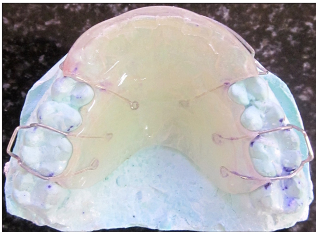
Figure 3 - The relaxation splint