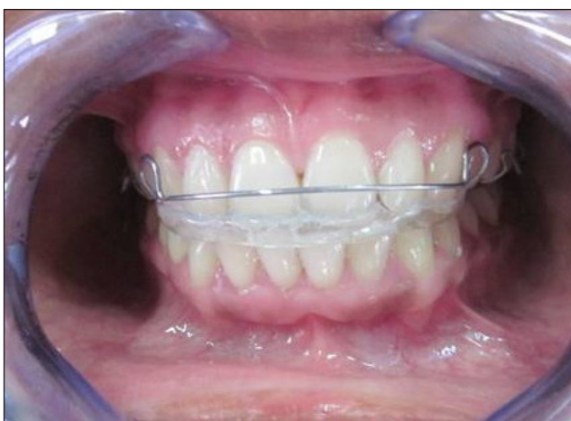
Figure 5 - Relaxation splint fit on maxillary teeth