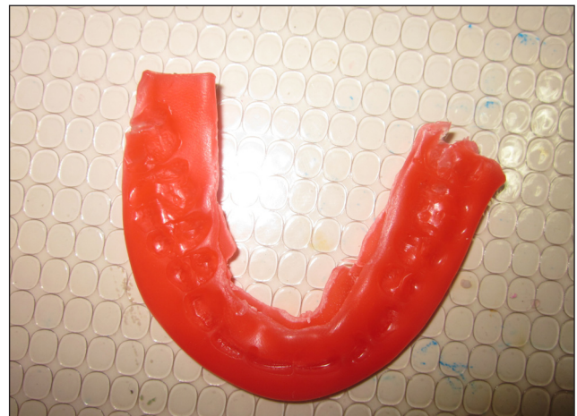
Figure 2 - The bite recorded